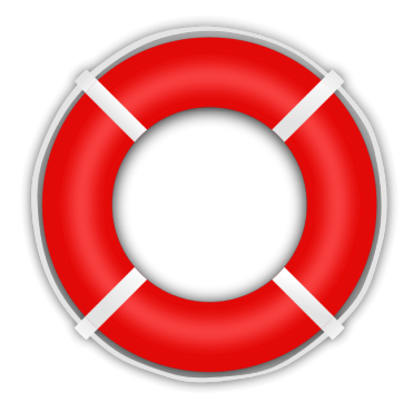
Lifeguard Certification Class